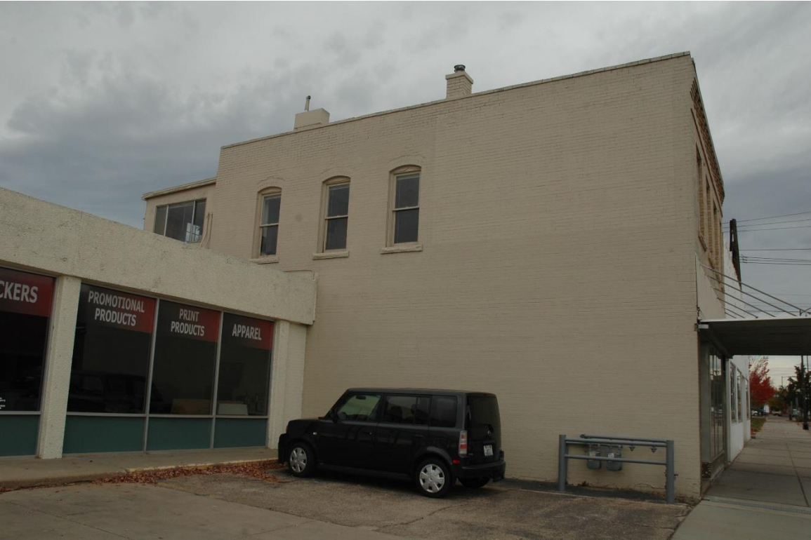
CD 1, Image 7, View to NNW of south side