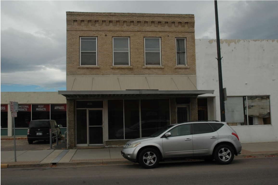
CD 1, Image 5, View to West of façade (east)