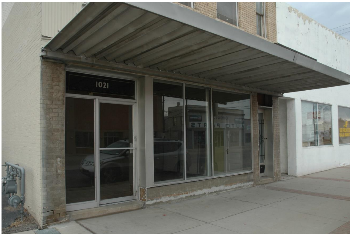
CD 1, Image 9, View to NW of lower façade (east