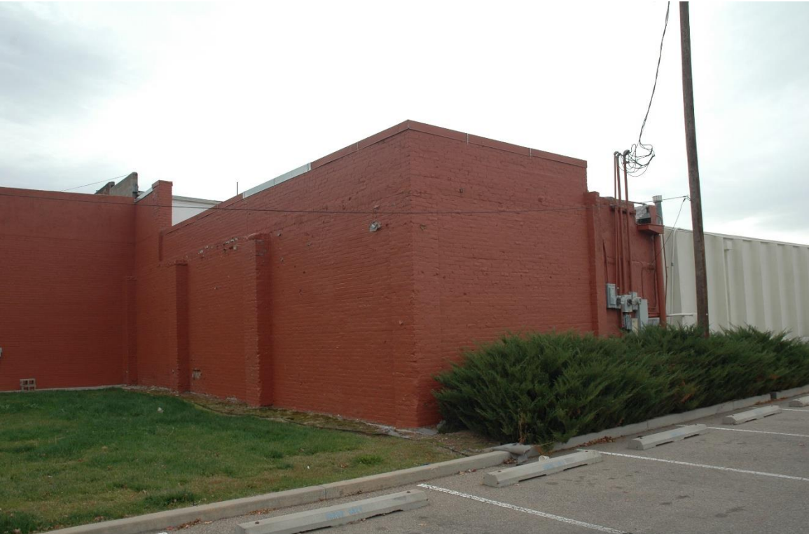
CD 1, Image 8, View to SE of rear portion of north side and of west (rear)