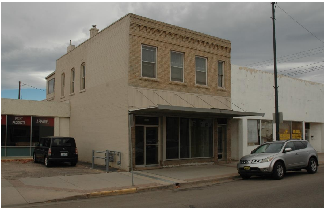
CD 1, Image 6, View to NW of façade (east) and south side