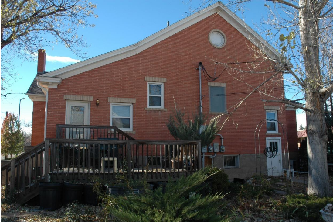
CD 2, Image 30, View to west of rear (east)