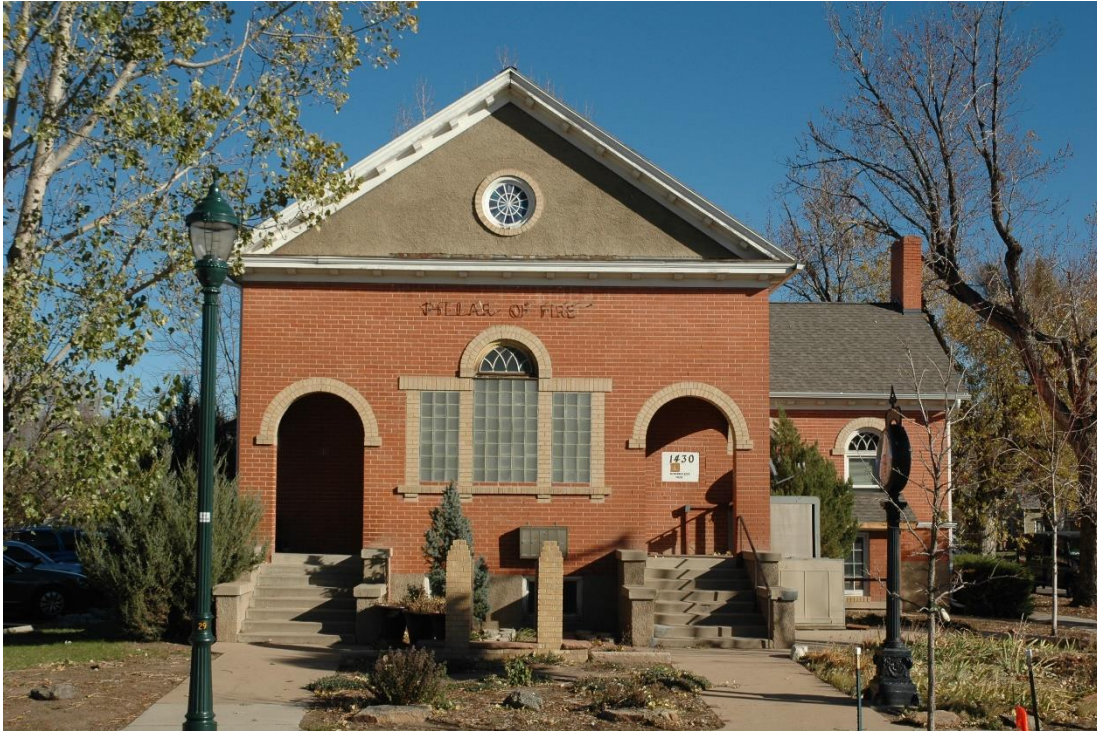
CD 2, Image 32, View to east of façade (west)