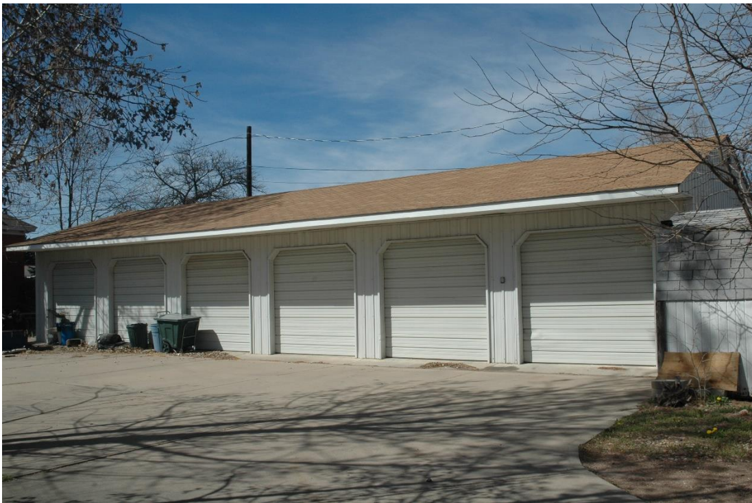
CD 3, Image 1, View to NW of Garage