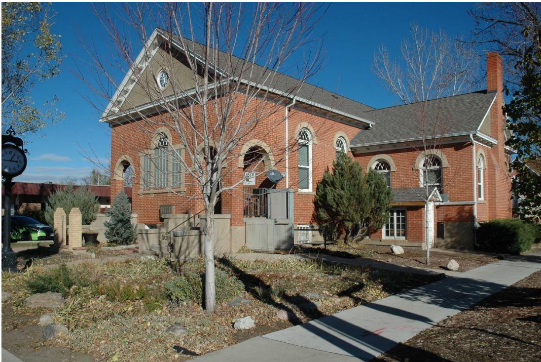
CD 2, Image 31, View to NE of façade (west) and front portion of the south side