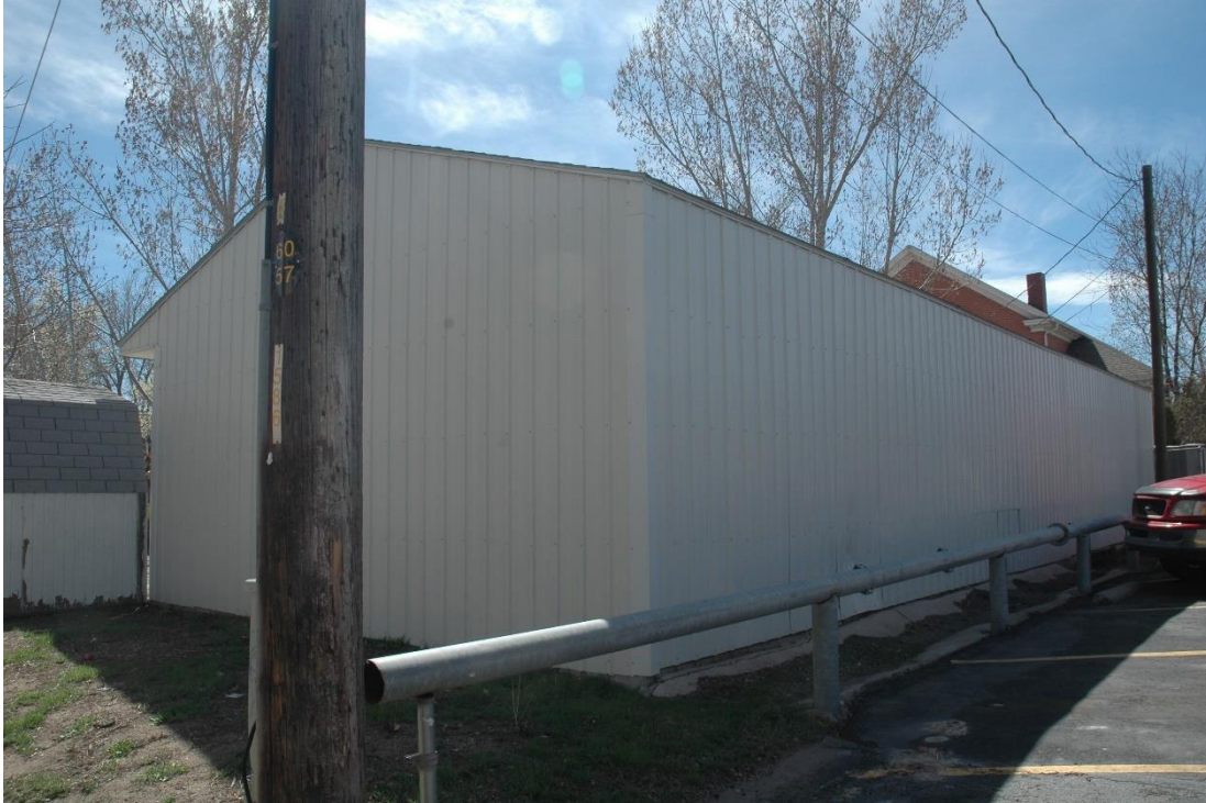
CD 3, Image 2, View to SW